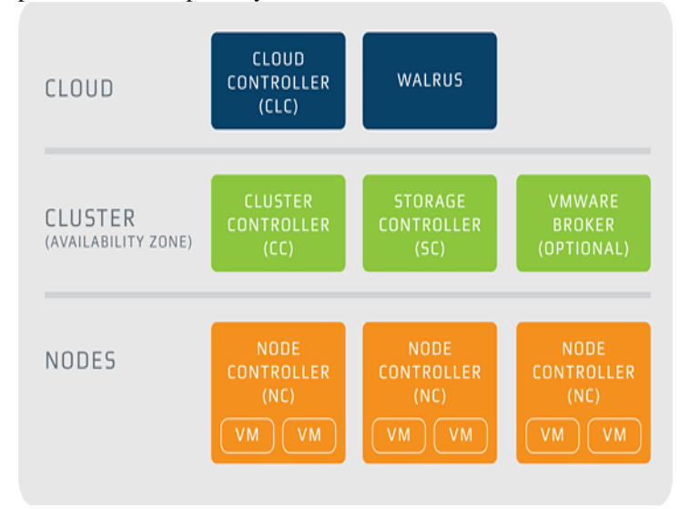
Figure 3.2: Architecture of Eucalyptus

Eucalyptus (Elastic Utility Computing Architecture for Linking Your Programs To Useful Systems) was released in May 2008. Eucalyptus software is available under GPL (General Public License) that helps in creating and managing a private or even a publicly accessible cloud.