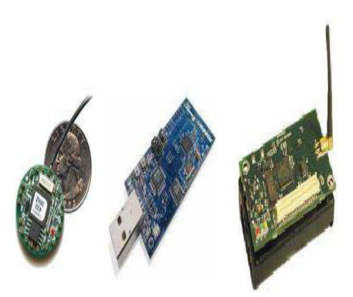
Figure 2 : Sensor nodes of WSN

In this research we proposed a method to fusion multi level clustering (FMLC) the sensor network according to the available energy of the cluster heads.