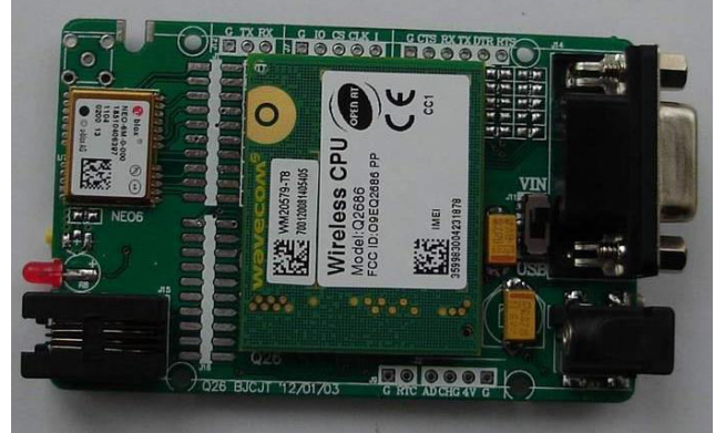
Fig. 2 Q2686 development board.

The supplier supports product development through there developer forums by discussing the issues and suggesting solutions.