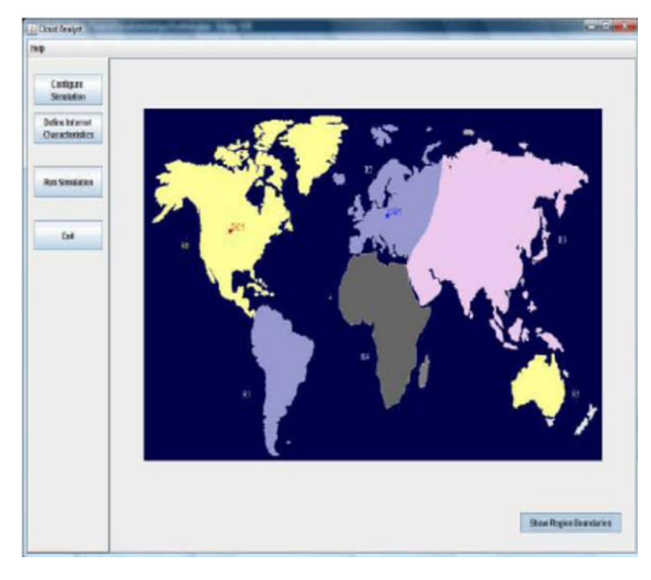
Fig (b)presenting gui for cloudsim analyst.

In this research to provides straightforward analysis on CloudSim Simulator, and contains simple experiments to study to use it in Cloud Environment. In Cloud computing environment mixed resources are accessible as services by producing Virtual Machines(VM), these resources achieved in improved technique through scheduling using GA.